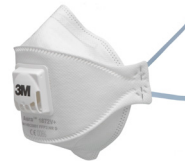
3M™ Aura™ Health Care Particulate Respirator 1872V+