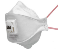
3M™ Aura™ Health Care Particulate Respirator 1873V+