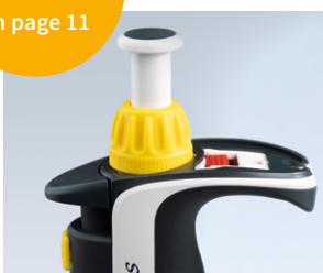
Easy Calibration technology