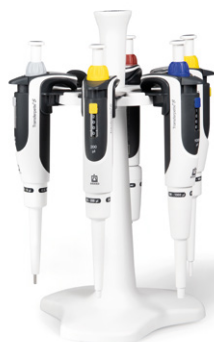
Pipette Package 2