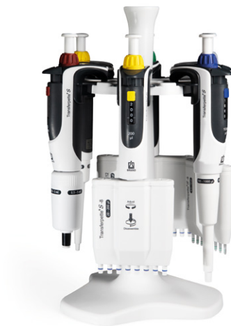
Bench top rack for 6 Transferpette® S single- or multi-channel pipettes.