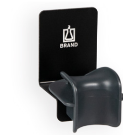
Wall mount for 1 Transferpette® S single- or multi-channel pipette.