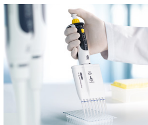
Working with PCR plates