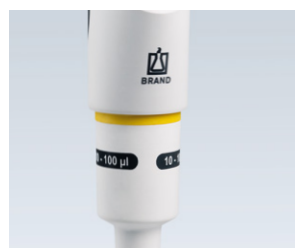
Integrated shaft coupling