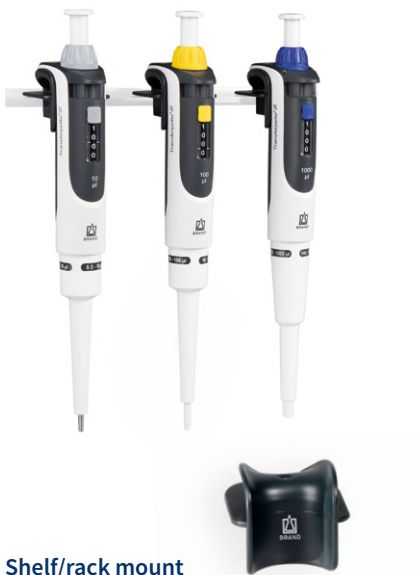
Shelf/rack mount for 1 Transferpette® S single- or multi-channel pipette.

With holders and stands, the devices are always properly stored and close at hand for the next application.