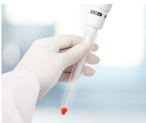
Narrow centrifuge tubes