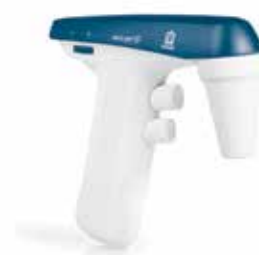
accu-jet® S, petrol