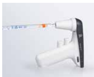
Rest position with inserted pipette