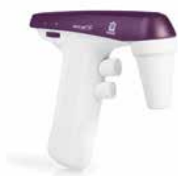
accu-jet® S, berry