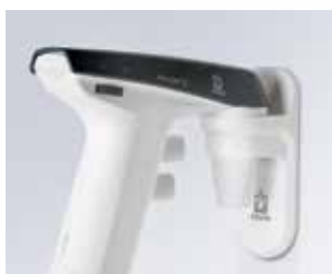
Wall mount for space-saving storage