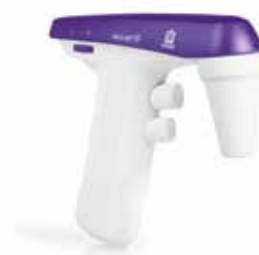
accu-jet® S, amethyst