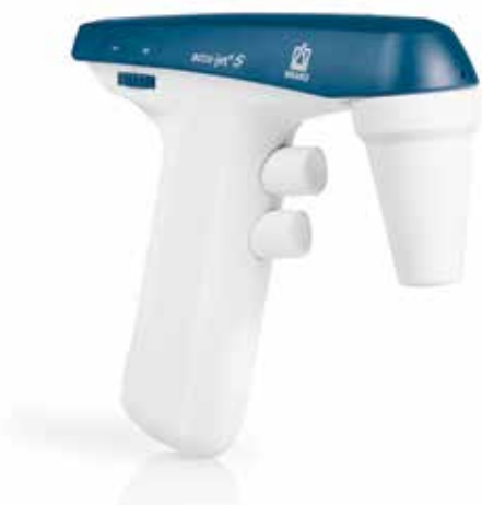
accu-jet® S, color: petrol

Efficient use of resources is what the accu-jet® S is all about. It is designed to make routine service tasks such as membrane filter replacement, adapter change, or battery replacement simple and easy for you. This and the robust design make it the perfect choice for long reliable service. The valve system ensures that no vapors remain inside the instrument, thus preventing corrosion. The membrane filter and check valve prevent liquid from accidentally getting into the instrument. Packaging and production use sustainable solutions. The packaging contains more than 90% recycled material, and manufacturing uses electric power from renewable sources.