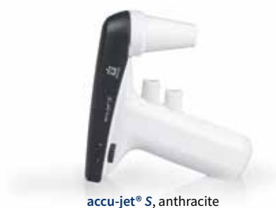
accu-jet® S, anthracite