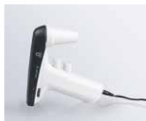
Smart charging technology prevents lazy battery effect